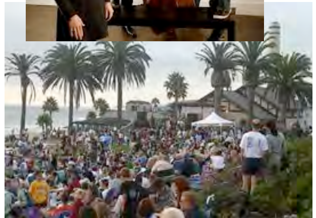
Photos: Board of Directors, Children's 4 th of July Parade, First Thursdays performers, Summer Twilight Concert participants