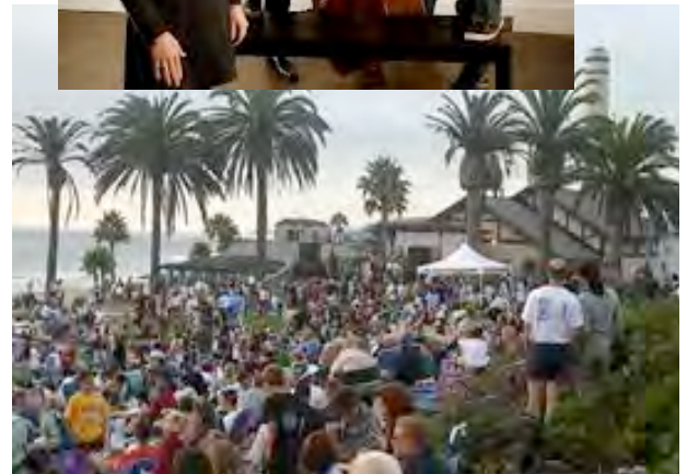
Photos: Board of Directors, Children's 4 th of July Parade, First Thursdays performers, Summer Twilight Concert participants