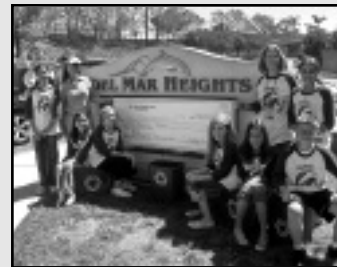
Del Mar Heights Grant

Working together to reduce waste, recycle and reuse in the school environment is the goal of committed 4th, 5th, and 6th graders who want to "Go Green." The Del Mar Foundation granted the PTA $1,200 to help make this noble cause a reality.