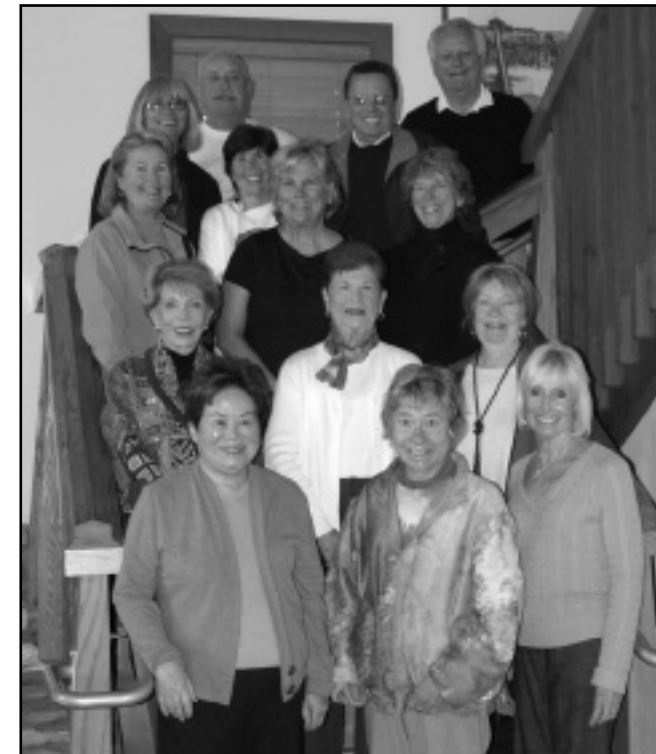
Cultural Arts Committee CA@delmarfoundation.org

Joining one of our committees is the way you can shape what happens in your community. It is so true that our community is what we make it. Would you like to see a Halloween Parade? Or revive the Payasada horses? How about a particular band at the Twilight Concerts? Interested in seeing a night of Gypsy music at First Thursdays? Do come join in and meet wonderful neighbors in the process. We promise you will have a good time doing lots of hard work. The Del Mar Foundation would love your help.