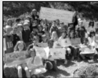
Del Mar Hills Grant

A special check for $820 covered the costs to take all the third grade students and teachers from the Del Mar Hills School to study animal and plant adaptations of the wetlands to our San Dieguito Lagoon. What a terrific educational experience.