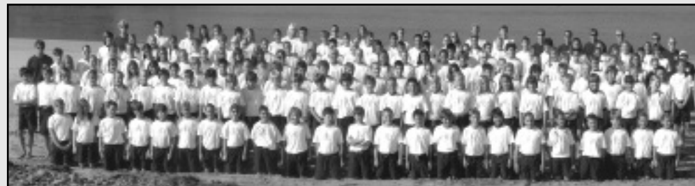
Junior Lifeguard Program

Our Junior Lifeguard program is the best in southern California if not the world. The Del Mar Foundation's $3,000 grant to this program ensures that children, no matter their income level, can partake in this important program.