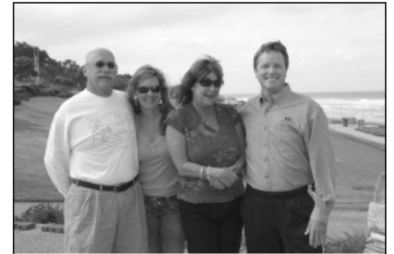
Summer Twilight Concert Committee Info@delmarfoundation.org

Cultural Arts Committee meets the first Wednesday after the First Thursdays event on the balcony of the Powerhouse.