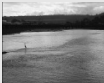
San Dieguito River Valley Grant

A grant to the San Dieguito River Valley for $1,200 brought excited students from the Del Mar schools to a very special Lagoon Day.