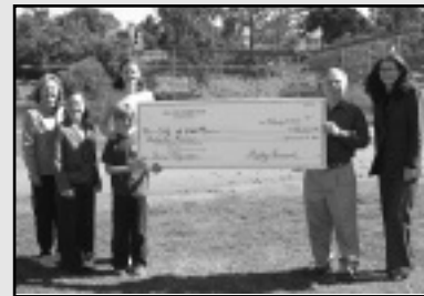
Shores Acquisition Grant

With a check for $35,000 to the City of Del Mar escrow fund, the Del Mar Foundation shows its commitment to Del Mar's campaign for open space.