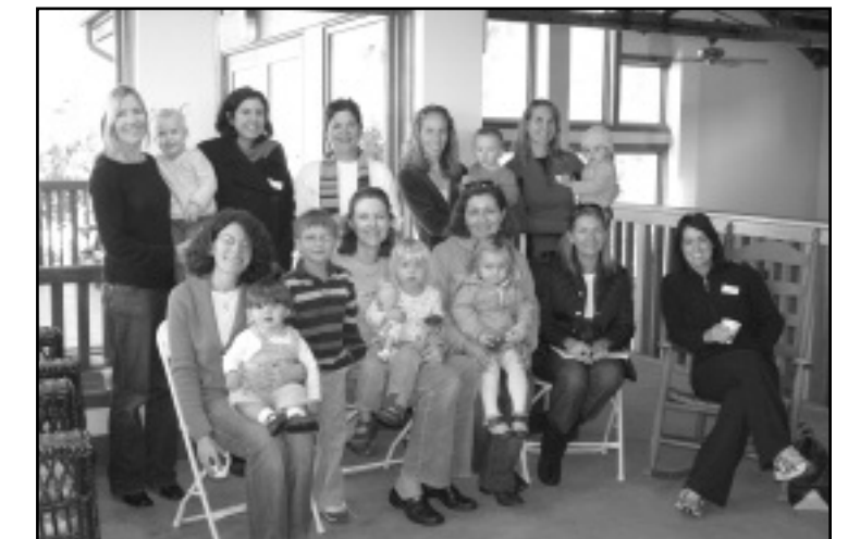
Children's Committee Children@delmarfoundation.org

Our Junior Lifeguard program is the best in southern California if not the world. The Del Mar Foundation's $3,000 grant to this program ensures that children, no matter their income level, can partake in this important program.