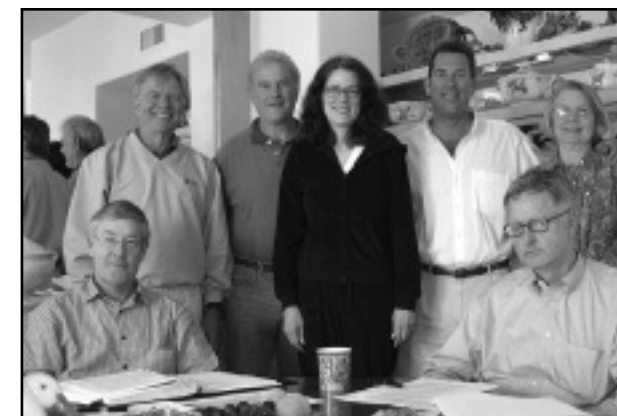
Investment Advisory Committee

The Children's Committee meets the last Wednesday of the month on the balcony of the Powerhouse.