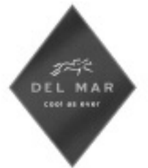
Del Mar Thoroughbred Club