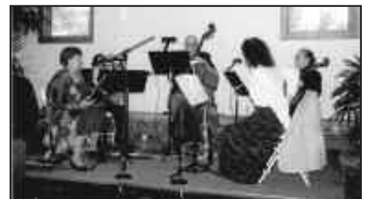
2000's - First Thursdays