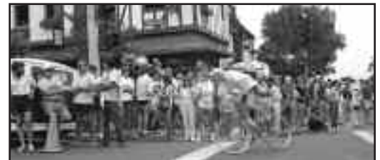
1980's - Del Mar Days

If the first decade of the Del Mar Foundation was Del Mar Days, picnics, and expanding the Summer Twilight Concerts, the second decade from 1992-2002 saw the addition of the Cultural Arts Committee and the popular First Thursdays subscription series plus the establishment of the incredible Children's Committee which sponsors civic parades, holiday parties, and other cultural activities for children.