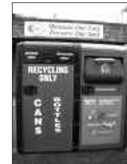
Big Belly Recycling Trash Can