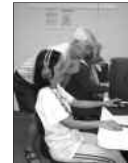
DMCC Brain Fitness Program