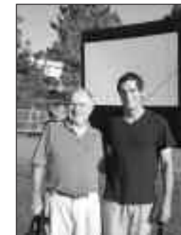
Friends of Del Mar Parks Cinema Series

Go to www.delmarfoundation.org for application