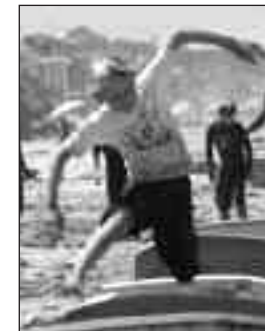
Del Mar Junior Lifeguard Program